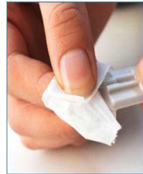
4. Wipe the core with a dust-proof cloth