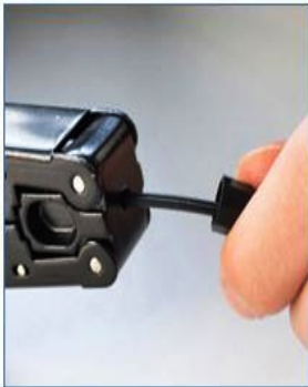
2. Stripped leather line for 5cm