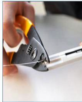
3. Remove the outside coating of the finisher with a Miller clamp