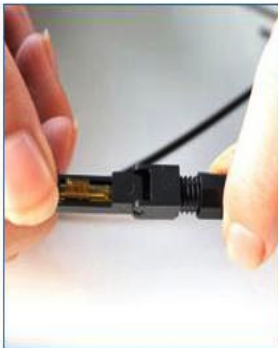
7. Tighten the leather line with the tail cover on the leather line