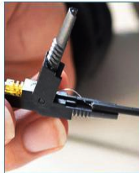
6. Insert the core into the cold protector against the embedded core