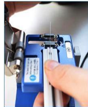
5. Cut the core with a cutting blade