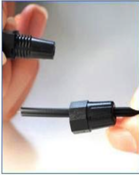
1. Remove the tail cover and put it in the leather line